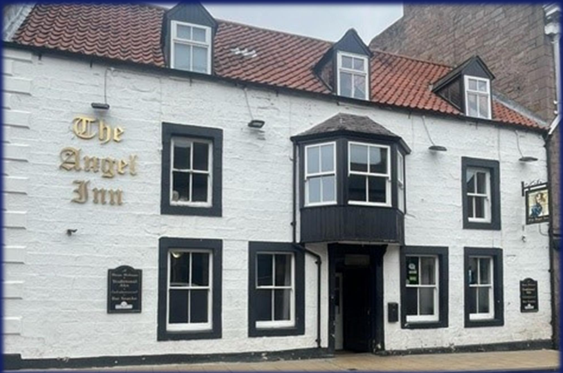
The Angel Inn, 4 High Street Wooler, Northumberland NE71 6BY